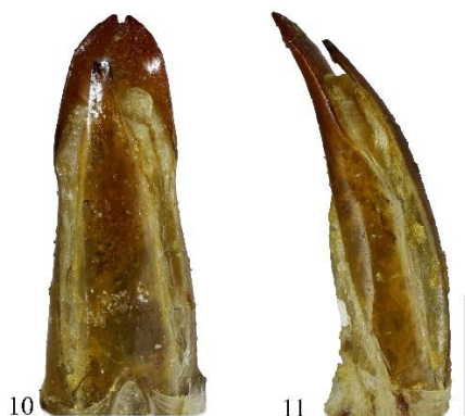
Figs 10-11. Aedeagus of Pachyteria diversipes bouvieri Ritsema, 1896: 10 – dorsal view; 11 – lateral view. Scale bar = 1.0 mm.

male); idem but 09.2017 (1 male), idem but 06.2016 (2 females).