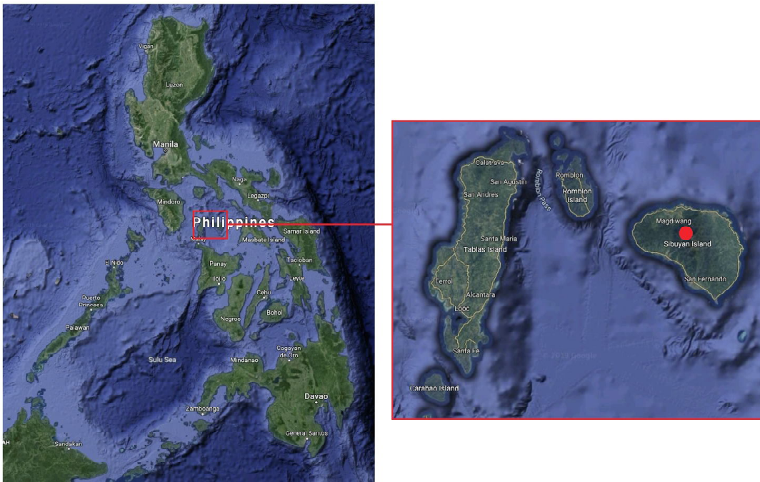
Fig. 3. Distribution map of the P. sibuyanensis sp. nov. (marked with red)